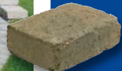
Rocky Mountain Blend